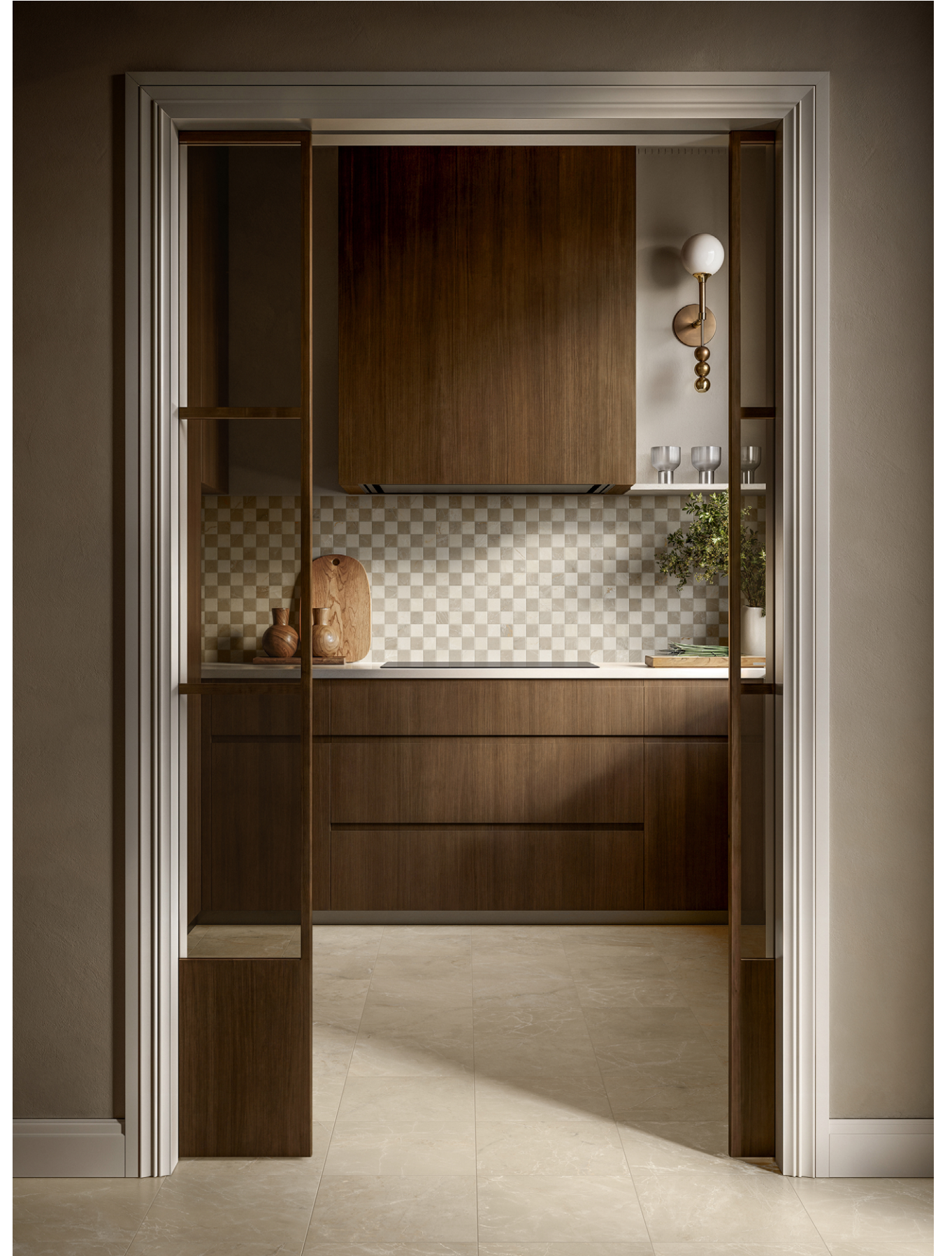
Coming Soon! Roma in Avorio and Visone