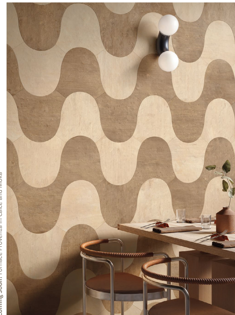
Coming Soon! Fornace Provenza in Calce and Moka