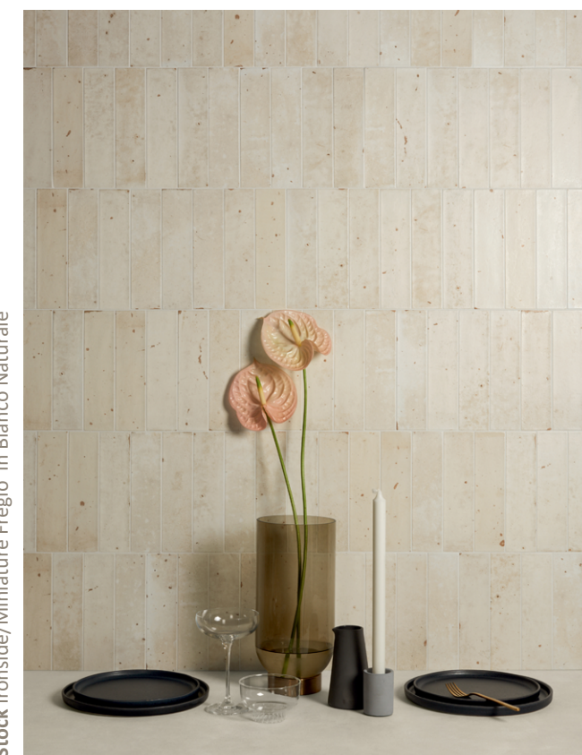
Stock Ironside/Miniature Fregio in Bianco Naturale