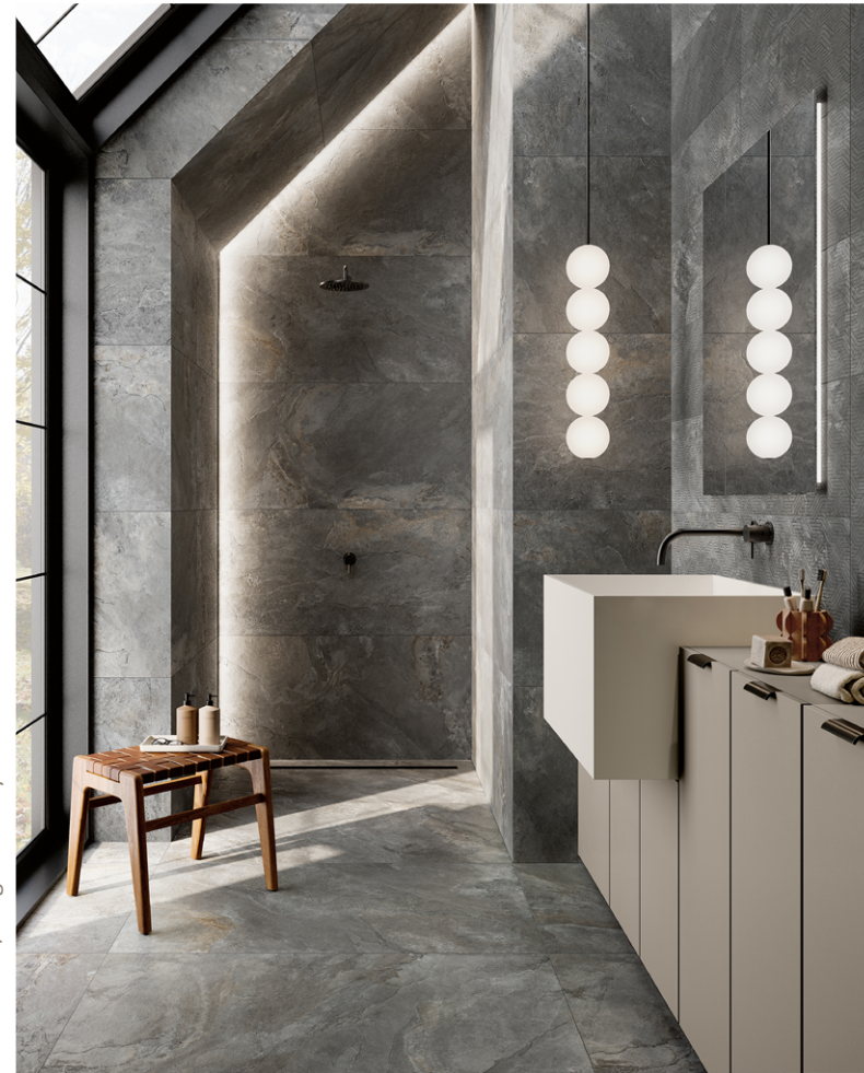
Stock Andes/Bergen in Gray

Today's Modern aesthetic is as tactile an experience as it is visual. You can discover the unique material mix that defines the aesthetic by simply running your hand across its surface. Concrete looks with dimensional aggregate that shifts in changing light. Stone looks with strong, sweeping movement. Natural wood looks with a discernible grain. All balanced by the smooth, refined surfaces of resin and marble. The contemporary iteration of the metropolitan aesthetic is defined by the tension between rough, unrefined industrial surfaces and the soft, comforting touch of natural materials.