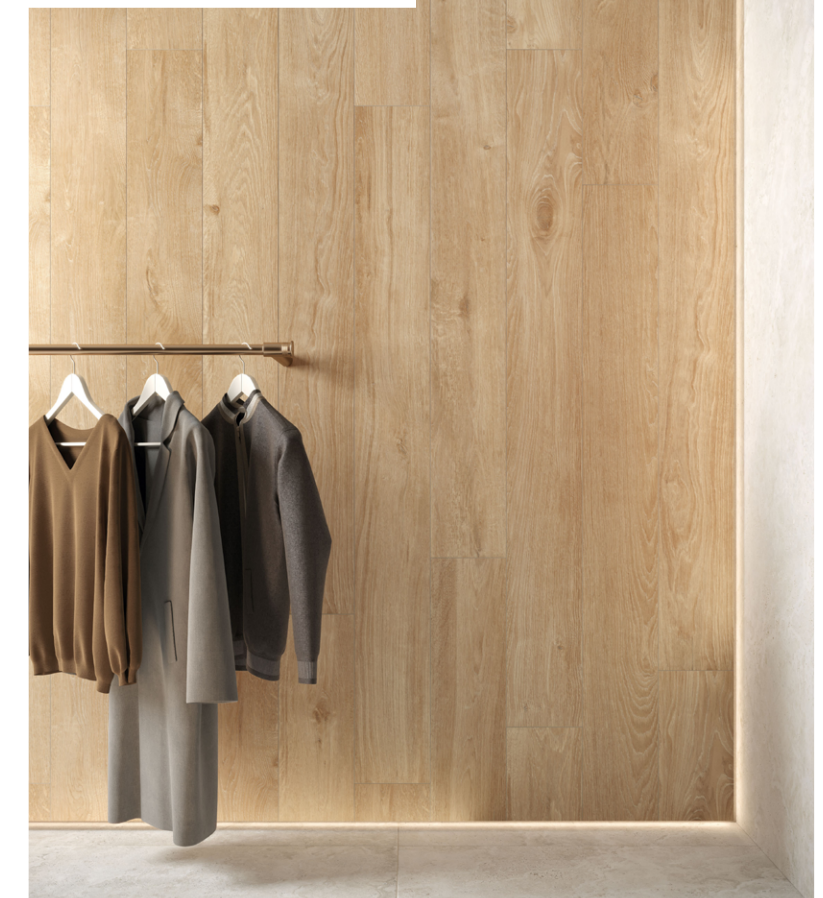
Stock Heritage/Gracy in Oak