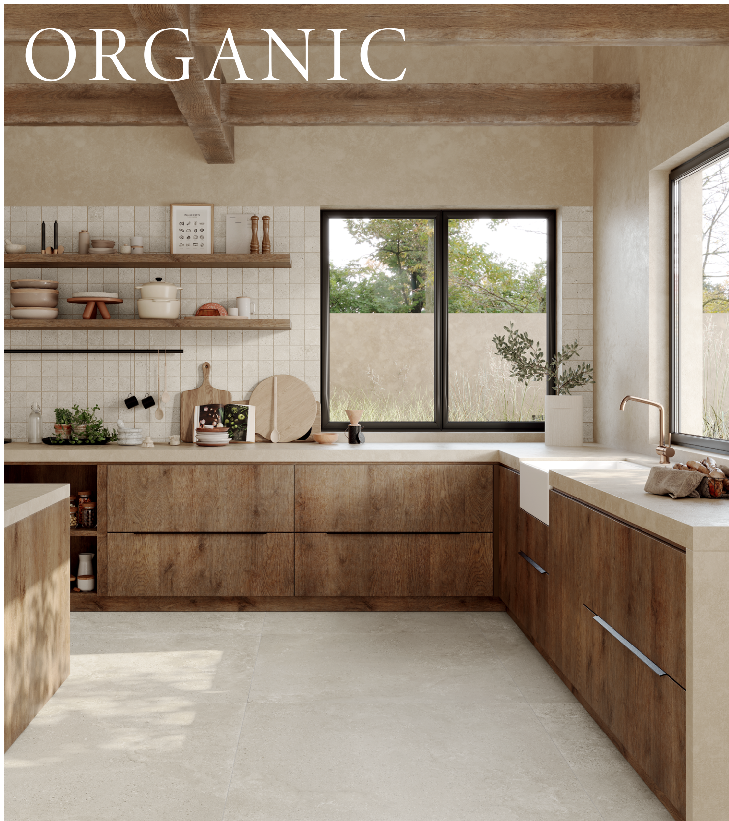
Stock Coast/Closer in White

The contemporary organic aesthetic draws on the authentic beauty of desert landscapes, translating sandy dunes, sun-bleached stone, and earth-worn surfaces into a sophisticated palette suited to modern spaces. Advances in digital printing and surface technology are pushing stone replication to greater heights, enabling manufacturers to achieve hyper-realistic graphics and tactile textures that rival natural stones. While warm neutrals continue to flourish, tile trends point to a commitment from manufacturers: organic does not mean boring. Wall applications are where this trend finds its boldest voice, layering dimensional decorative accents and sculptural shapes against subtle, neutral backdrops for maximum visual impact. The contemporary organic look offers a rare duality — the warm, authentic look we crave, offset by the sculptural, statement-making details that define cutting-edge interiors.