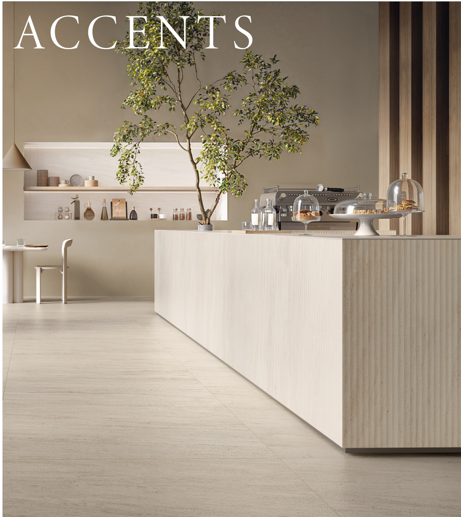
Coming Soon! Lightstones 01 in Desert

In a season dominated by cream and beige, the accent piece is having its moment. Spaces built on neutral tones and subtle stones leave plenty of room for confident, unique accent pieces. Blues and greens bring a calming, earthy appeal without straying from the growing trend of soothing design. Warmer terracotta tones and deep burgundy bring life to a stagnant space. Handmade looks with high color variation find beauty in irregularity and draw viewers to take a closer look. Linear texture adds dimension without noise. The contemporary obsession with a clean, neutral base is an invitation to experiment. Patterned pieces boldly accept that invitation, flaunting a mixture of color, finish, and feel. Contemporary tile welcomes blended aesthetics, presenting designers with permission to play.