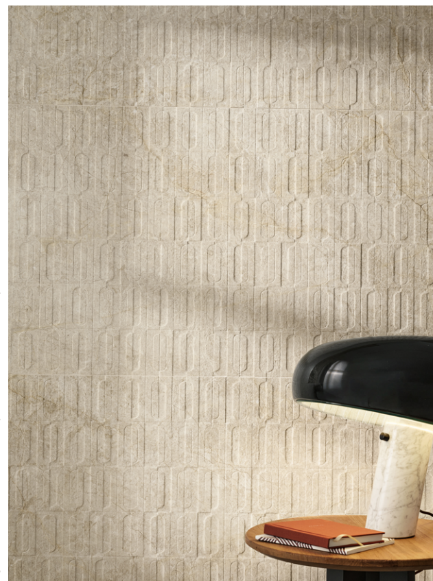
Special Order Vision/Thymos in Tellur Ovelyn Deco