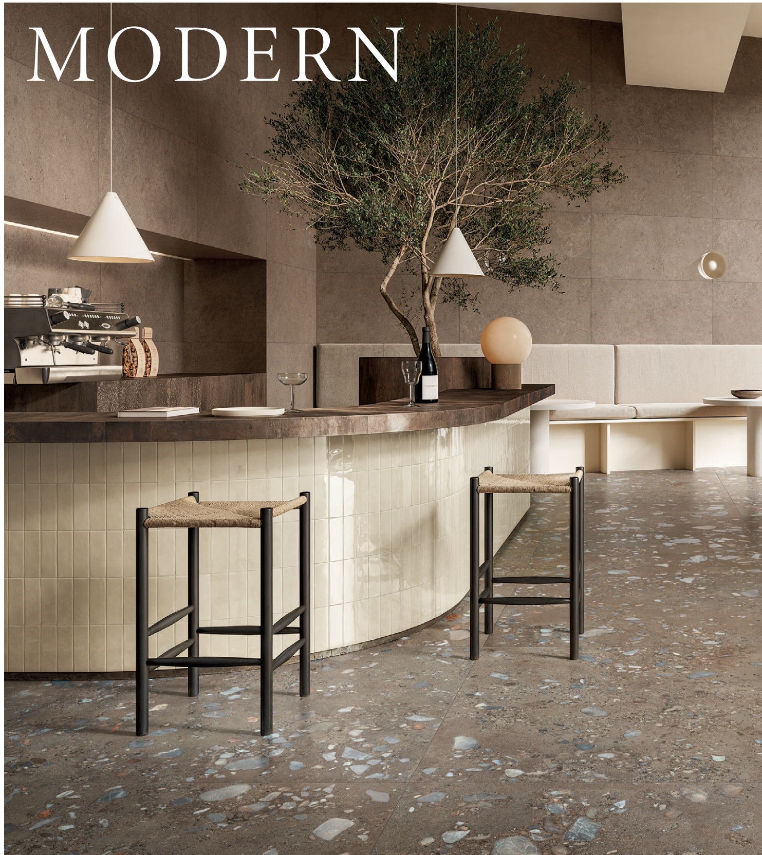
Special Order Riverstone in Brown

Today's Modern aesthetic is as tactile an experience as it is visual. You can discover the unique material mix that defines the aesthetic by simply running your hand across its surface. Concrete looks with dimensional aggregate that shifts in changing light. Stone looks with strong, sweeping movement. Natural wood looks with a discernible grain. All balanced by the smooth, refined surfaces of resin and marble. The contemporary iteration of the metropolitan aesthetic is defined by the tension between rough, unrefined industrial surfaces and the soft, comforting touch of natural materials.