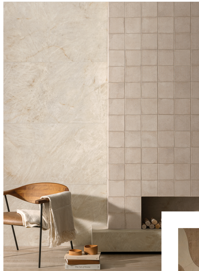
Coming Soon! Sabi in Bone

The contemporary organic aesthetic draws on the authentic beauty of desert landscapes, translating sandy dunes, sun-bleached stone, and earth-worn surfaces into a sophisticated palette suited to modern spaces. Advances in digital printing and surface technology are pushing stone replication to greater heights, enabling manufacturers to achieve hyper-realistic graphics and tactile textures that rival natural stones. While warm neutrals continue to flourish, tile trends point to a commitment from manufacturers: organic does not mean boring. Wall applications are where this trend finds its boldest voice, layering dimensional decorative accents and sculptural shapes against subtle, neutral backdrops for maximum visual impact. The contemporary organic look offers a rare duality — the warm, authentic look we crave, offset by the sculptural, statement-making details that define cutting-edge interiors.