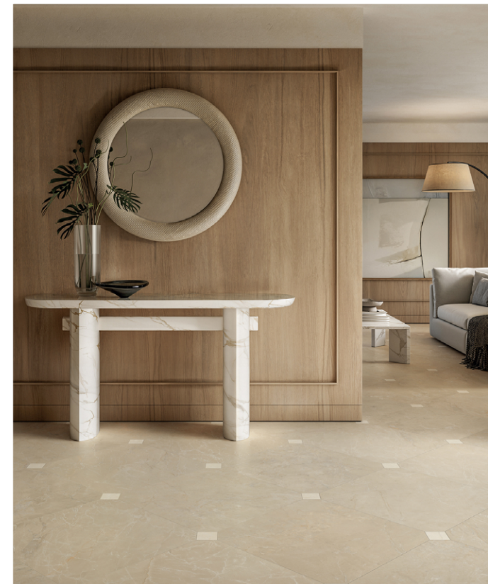
Coming Soon! Roma in Avorio and Visone