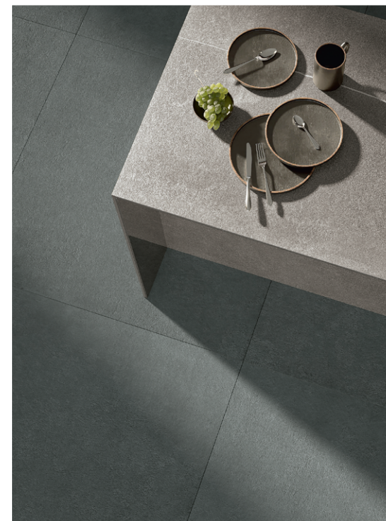
Special Order Balance in Steel Blue