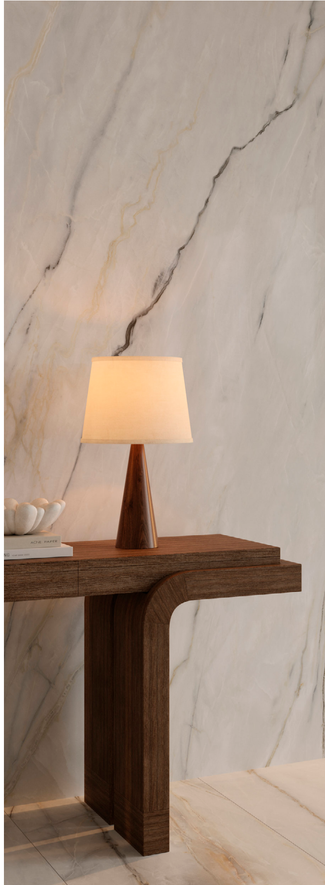
Special Order Classic Boutique in Calacatta Bluette