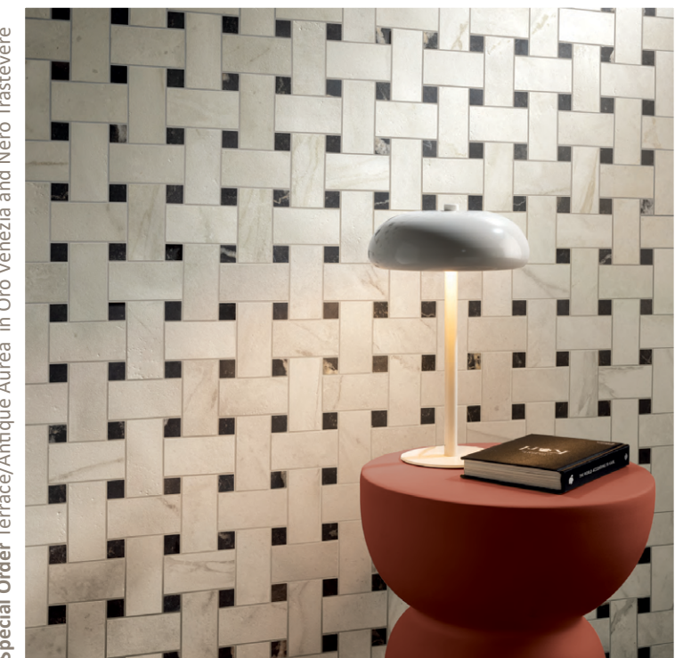
Special Order Terrace/Antique Aurea in Oro Venezia and Nero Trastevere