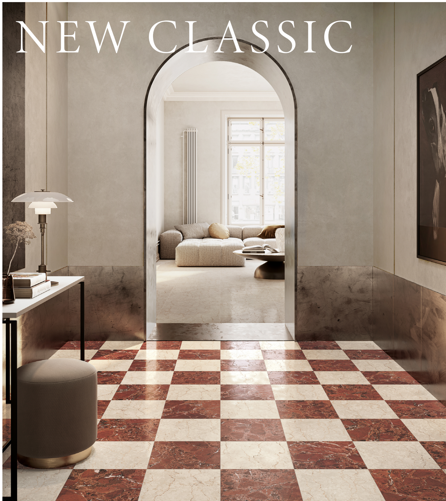
Special Order Mind in Belfiore and Garnet

Ring, ring — the 80s are calling, and this time, we’re picking up. Green and burgundy marble looks are making an undeniable comeback, and while that may trigger a flashback or two for those of us who grew up in the 90s, the execution has never looked more current. Today’s porcelain technology is rendering these storied colorways with a sophistication and restraint that feels entirely fresh — subtle veining, softer honed finishes, and a refined palette that owes more to ancient Roman bathhouses than to dated country club interiors. Patterned installations and intricate mosaics are reclaiming their status as marble’s ultimate showpiece, their Old World craftsmanship reframed through a contemporary lens. New Classic is a reminder that in design, as in fashion, the most forward-thinking move is often a knowing glance backward.