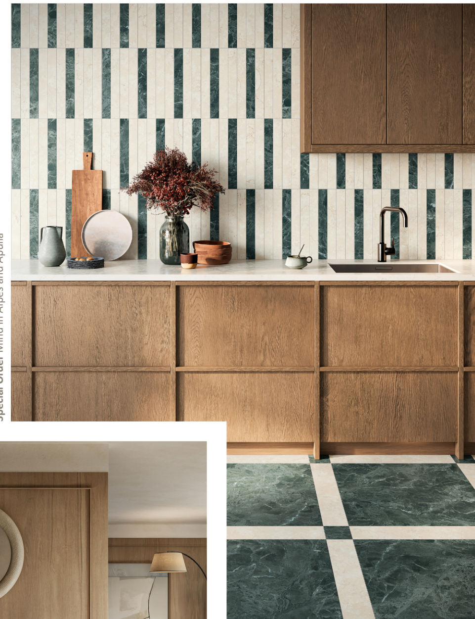
Special Order Mind in Alpes and Apulia

Ring, ring — the 80s are calling, and this time, we’re picking up. Green and burgundy marble looks are making an undeniable comeback, and while that may trigger a flashback or two for those of us who grew up in the 90s, the execution has never looked more current. Today’s porcelain technology is rendering these storied colorways with a sophistication and restraint that feels entirely fresh — subtle veining, softer honed finishes, and a refined palette that owes more to ancient Roman bathhouses than to dated country club interiors. Patterned installations and intricate mosaics are reclaiming their status as marble’s ultimate showpiece, their Old World craftsmanship reframed through a contemporary lens. New Classic is a reminder that in design, as in fashion, the most forward-thinking move is often a knowing glance backward.