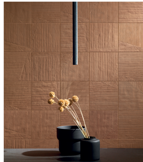
Special Order Seaside/Sassoscrito in Coral