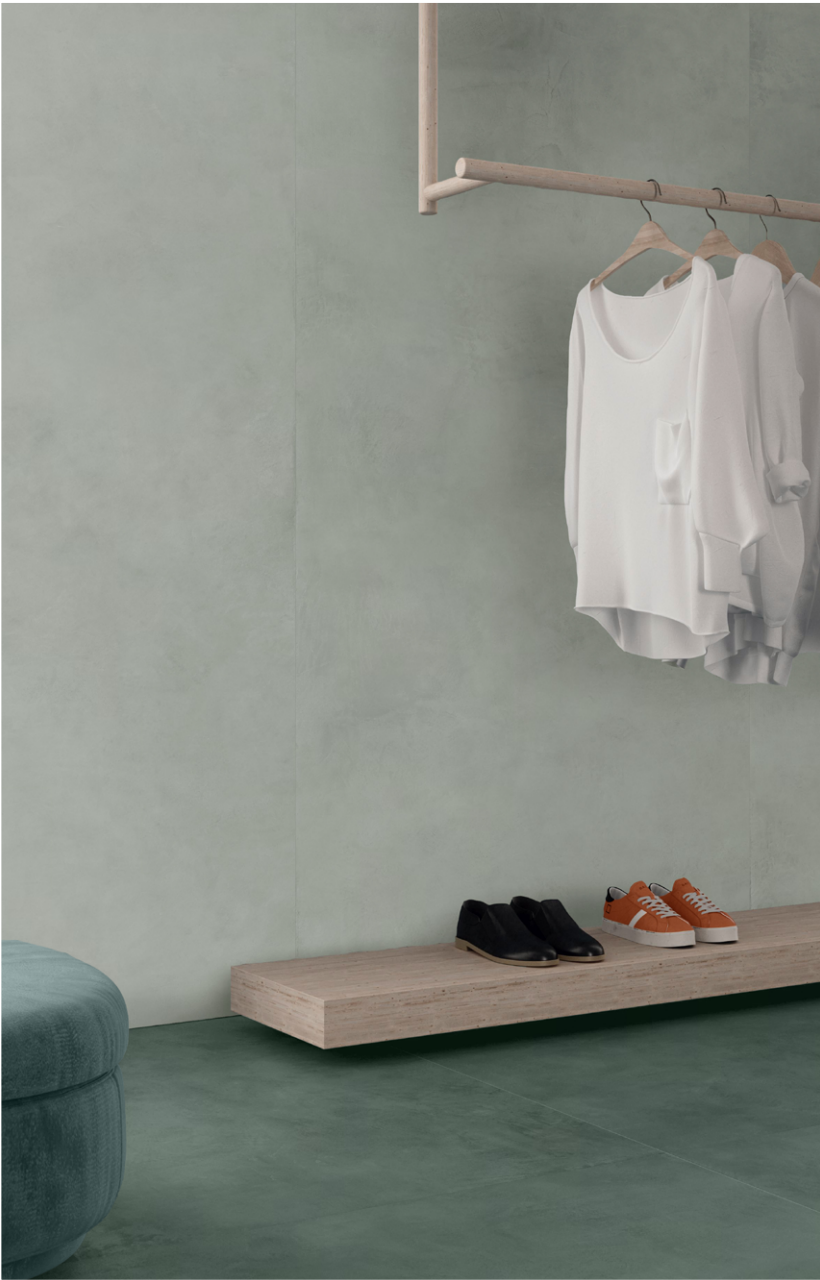
Stock Edge/Colovers+ in Sage and Jade

The formula for a whimsical interior is delightfully simple: start with warm wood tones and creamy off-white walls, add a charming pastel tile, and sprinkle in colorful resin accents wherever they shine best. Bonus points for a bold pattern—checkboard never fails—and a playful mix of glossy and matte finishes for tactile contrast. With light tones dominating the scene at Cersaie, it’s no surprise that pastels continue to steal the spotlight. While beige with a kiss of burgundy defines the season’s chic, sophisticated palette, her fun-loving sister brings a pastel base and crisp white accents.