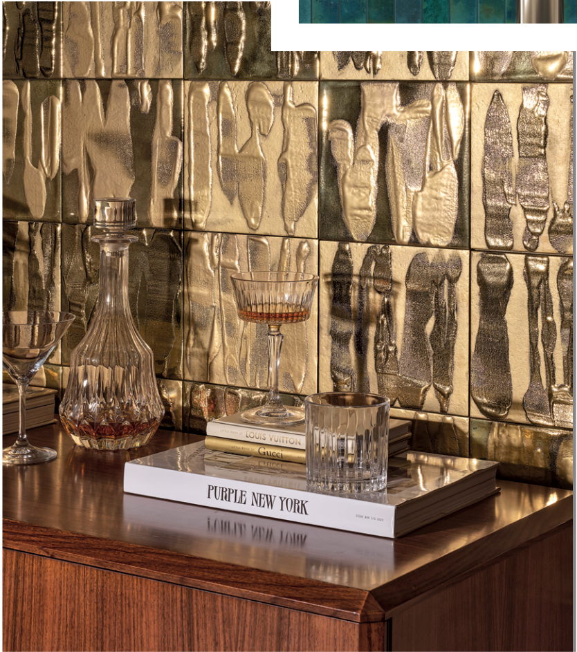
Special Order Showall in Oro Puro