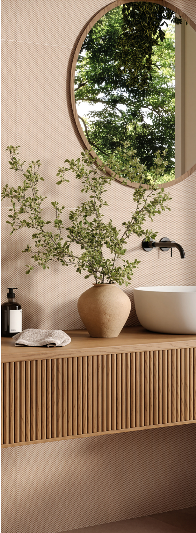
Special Order Retina in Terracotta