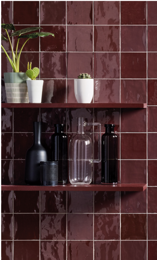
Special Order Shine/Color Art in Burgundy

For those who find beige uninspiring and pastels too subdued, manufacturers have the bold looks you are craving. Wallpaper-look tiles are evolving with advanced production techniques, incorporating dimensional glazes, metallic accents, and layered textures that bring a new level of sophistication to surfaces. The eclectic luxury of wallpaper-look pairs perfectly with timeless marble looks. At Cersaie, marble took center stage in every form imaginable: from pristine whites to moody, dramatic tones, and a dazzling array of marble mosaics, adding a playful twist to classic elegance. Jewel tones, particularly greens, blues, and burgundies, are key accent colors this year, providing depth and contrast within bold, expressive interiors. While minimalist spaces continue to offer a sense of calm, maximalist luxury transports visitors into a lush fantasy where texture, color, and drama reign supreme.