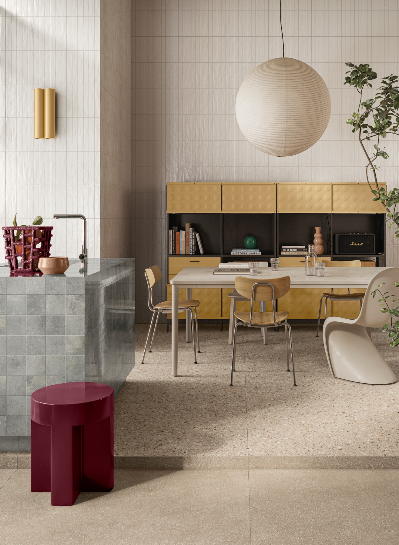
Coming Soon! Gravel in Sand