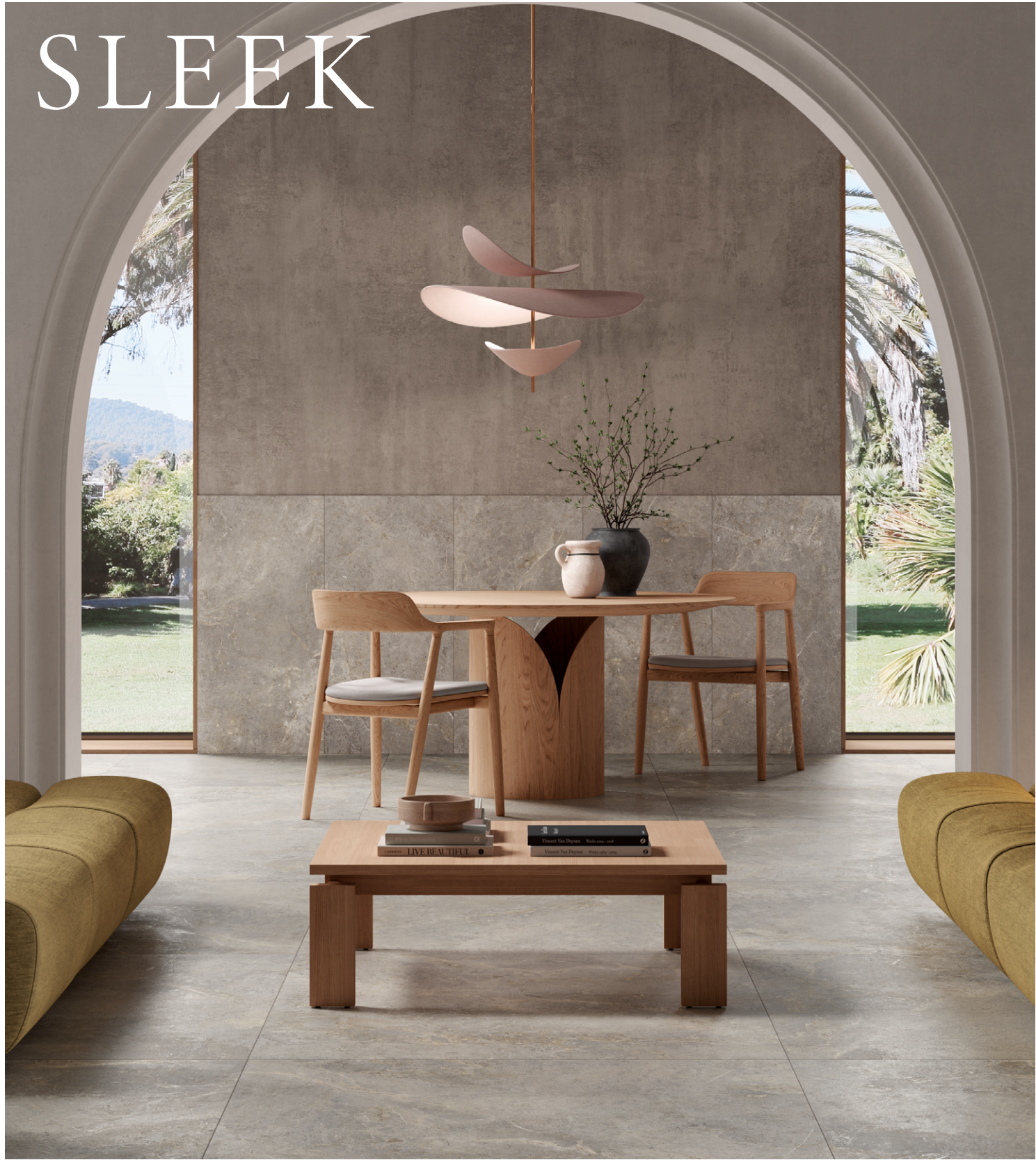
Coming Soon! Newport/Everstone in Greige

The urban-industrial aesthetic cannot escape the turn towards comfort, embracing the appeal of biophilic design. Organic stone finishes, sleek resin surfaces, and the refined pebbling of modern concrete add a soft contrast to the rough, time-worn finishes that previously defined this aesthetic. The result: a sleek, polished reincarnation of the metropolitan look. As the serene, organic trend gravitates towards beige, cool-toned stones are re-emerging in contemporary spaces, grounding neighboring metal and concrete looks with the enduring calm of nature. Don't mistake this embrace of comfort as a shift towards the dull. Bold black-and-white contrast, burgundy accents, and dimensional finishes add a touch of drama to contemporary spaces.