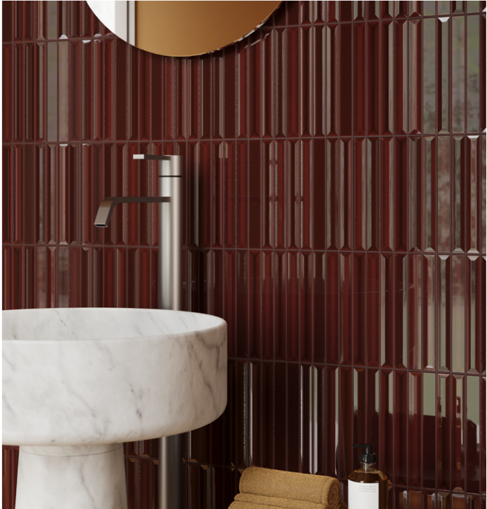
Special Order Flautini in Tabacco