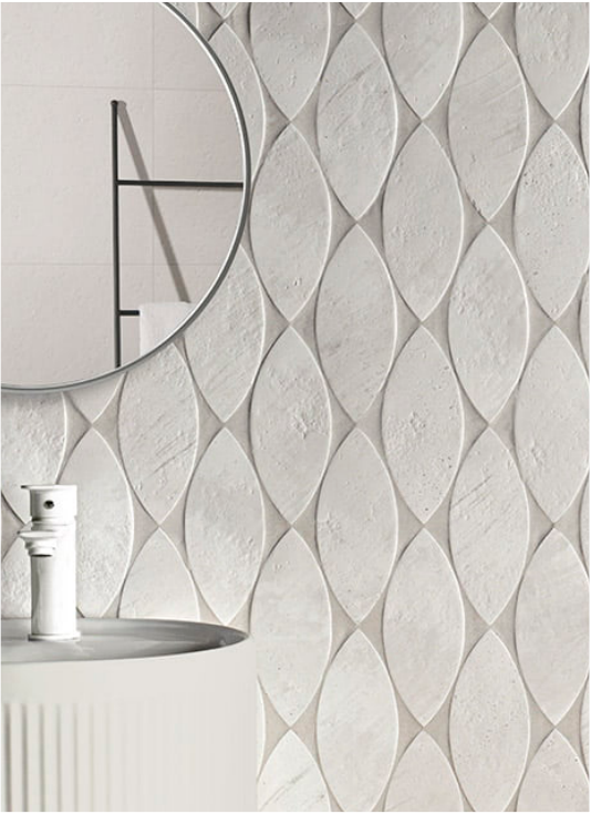
Coming Soon! Connect in Snow