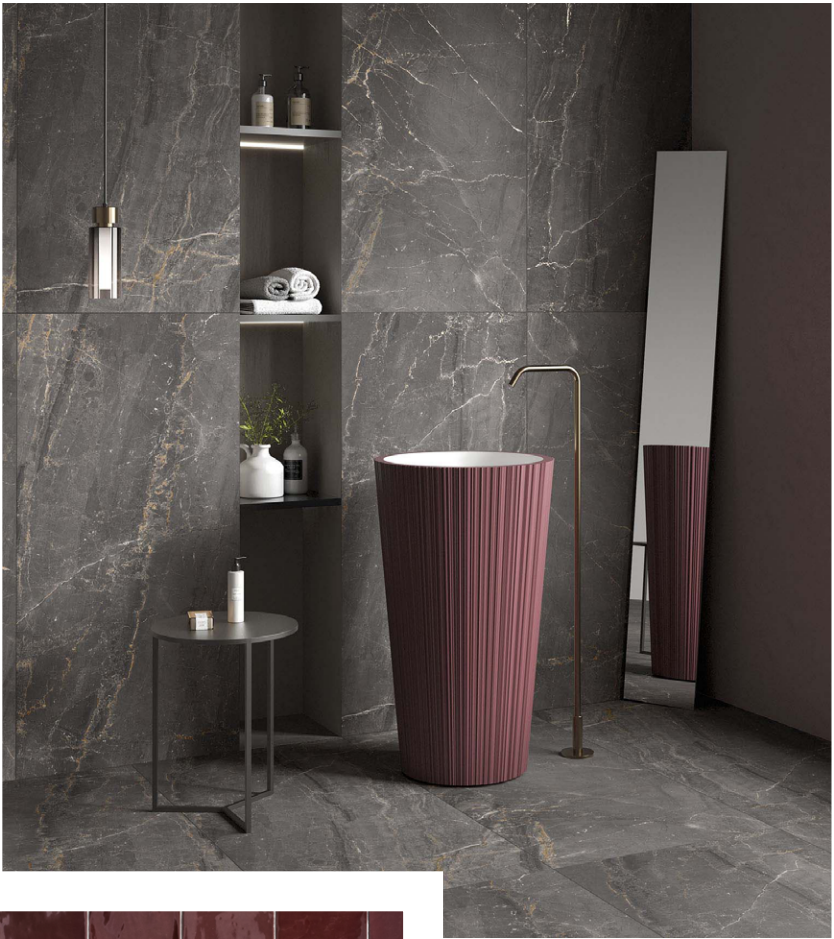
Stock Dream/Charme in Black