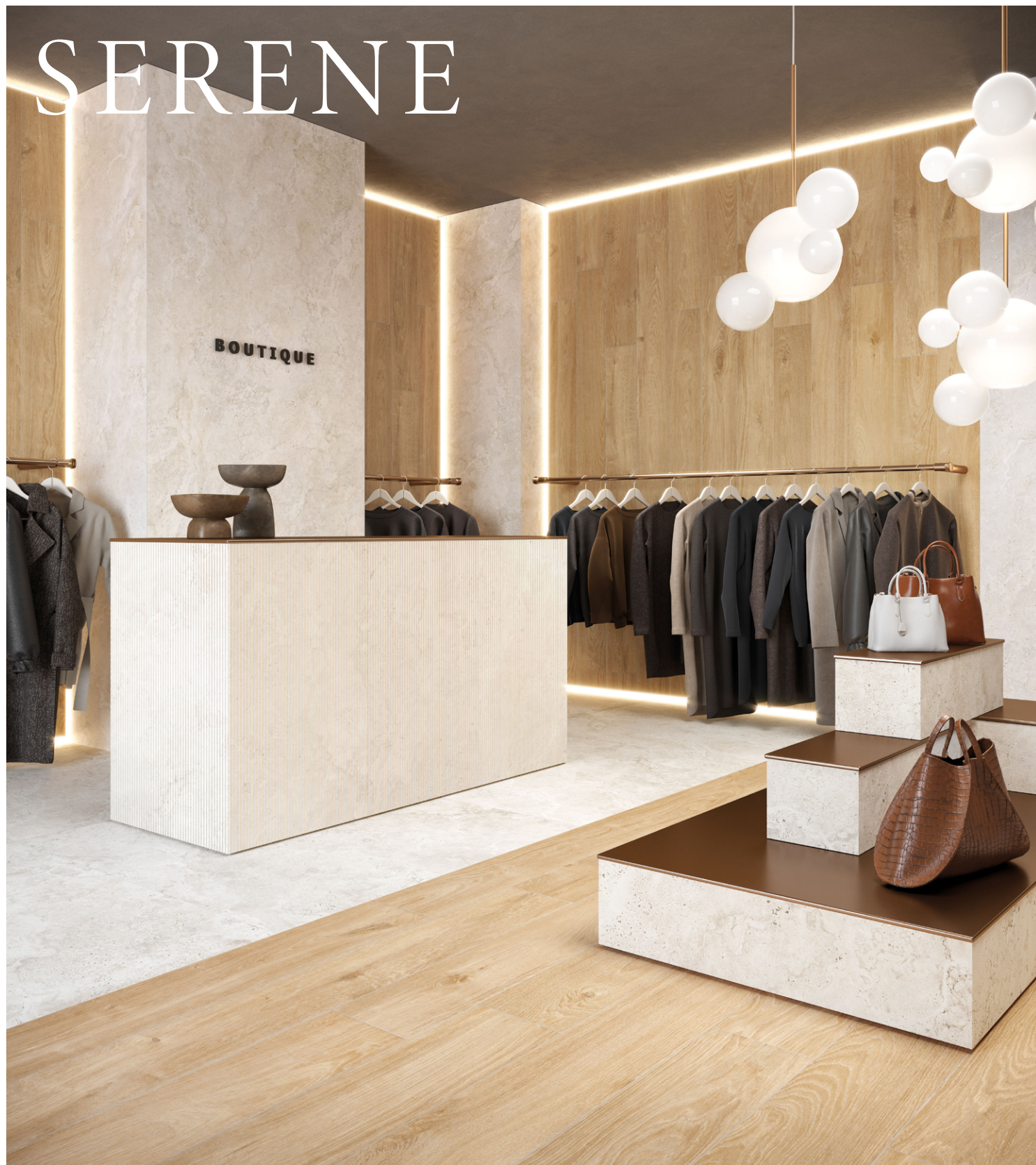
Coming Soon! Gracy in Oak

Beige is making a confident comeback. At Cersaie, warm, creamy whites and layered beige tones dominated floors and walls. The message across many exhibitors was consistent: serene, restorative spaces are defining the next design movement. To keep beige interiors engaging, manufacturers suggest mixing materials. Sedimentary-inspired surfaces—ranging from the fine texture of shellstone to the expressive inclusions of ceppo di gré—introduce organic depth and authenticity. Wood looks in natural tones, dimensional decos, and soft matte wall tiles provide accents and statement pieces without detracting from the understated palette. The result: a contemporary sense of tranquility that feels refined, grounded, and inherently livable.