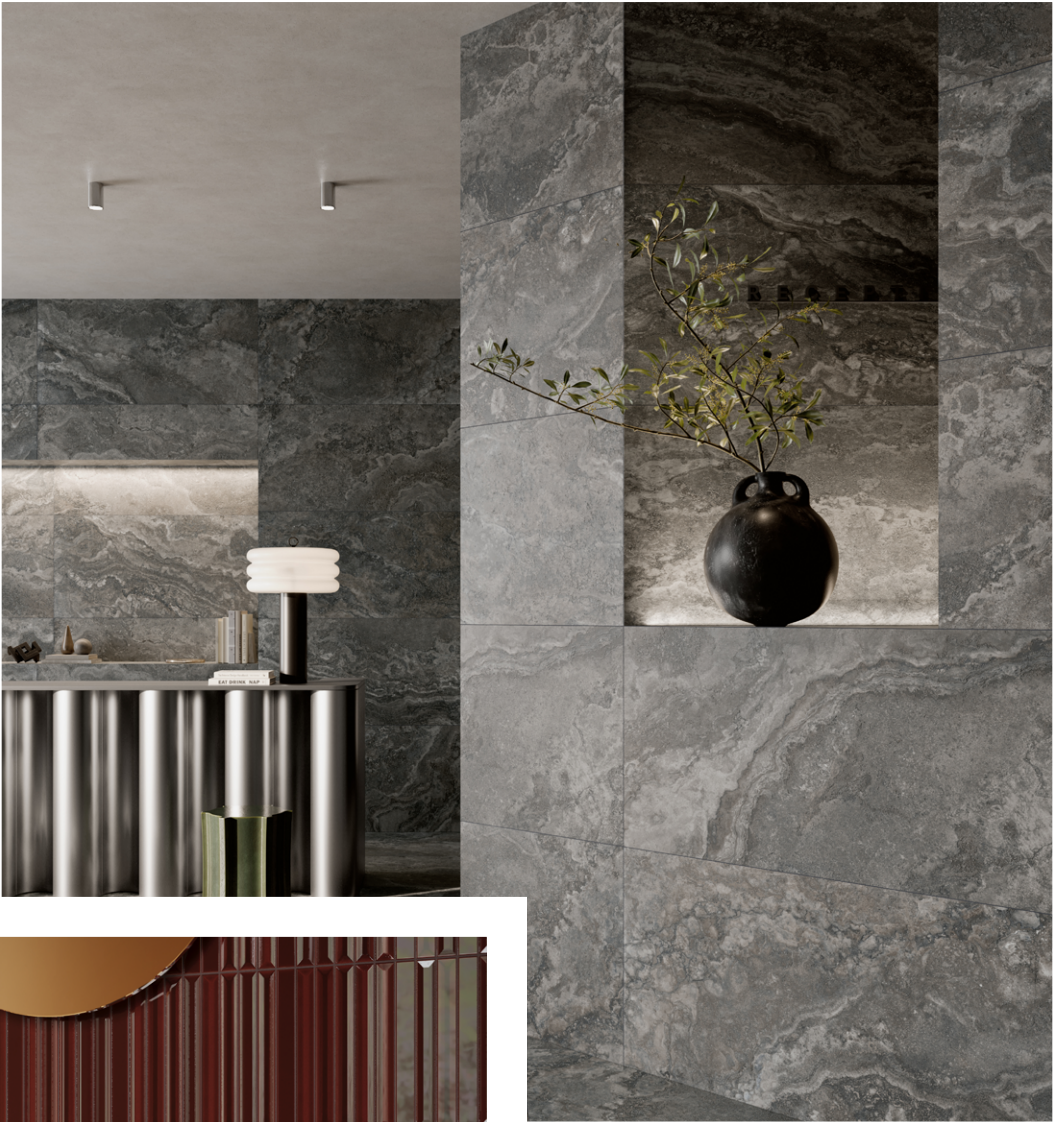
Coming Soon! Roma in Grey

The urban-industrial aesthetic cannot escape the turn towards comfort, embracing the appeal of biophilic design. Organic stone finishes, sleek resin surfaces, and the refined pebbling of modern concrete add a soft contrast to the rough, time-worn finishes that previously defined this aesthetic. The result: a sleek, polished reincarnation of the metropolitan look. As the serene, organic trend gravitates towards beige, cool-toned stones are re-emerging in contemporary spaces, grounding neighboring metal and concrete looks with the enduring calm of nature. Don't mistake this embrace of comfort as a shift towards the dull. Bold black-and-white contrast, burgundy accents, and dimensional finishes add a touch of drama to contemporary spaces.