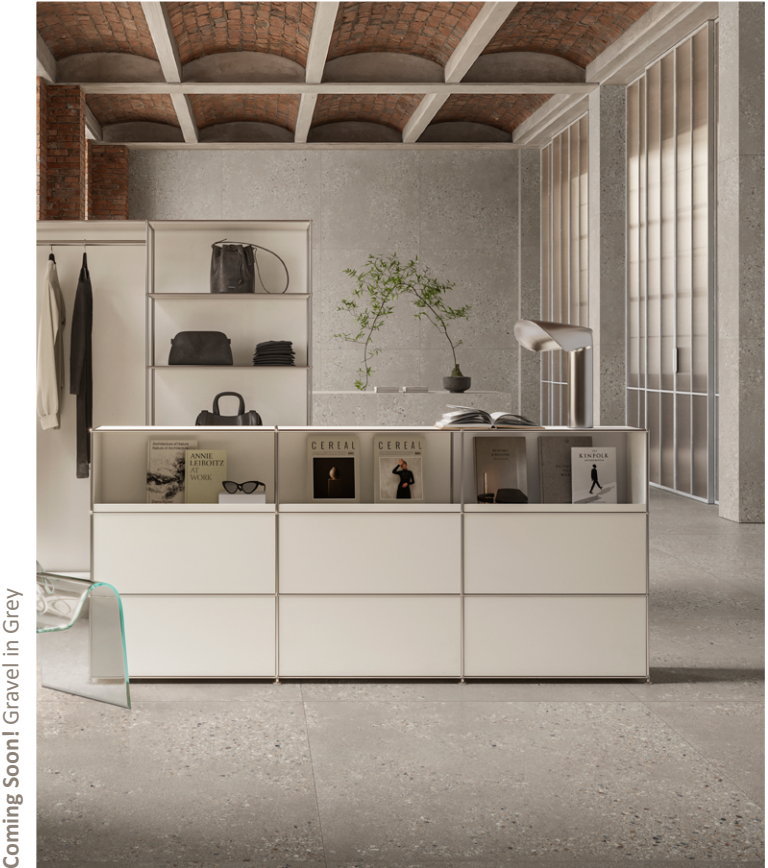
Coming Soon! Gravel in Grey