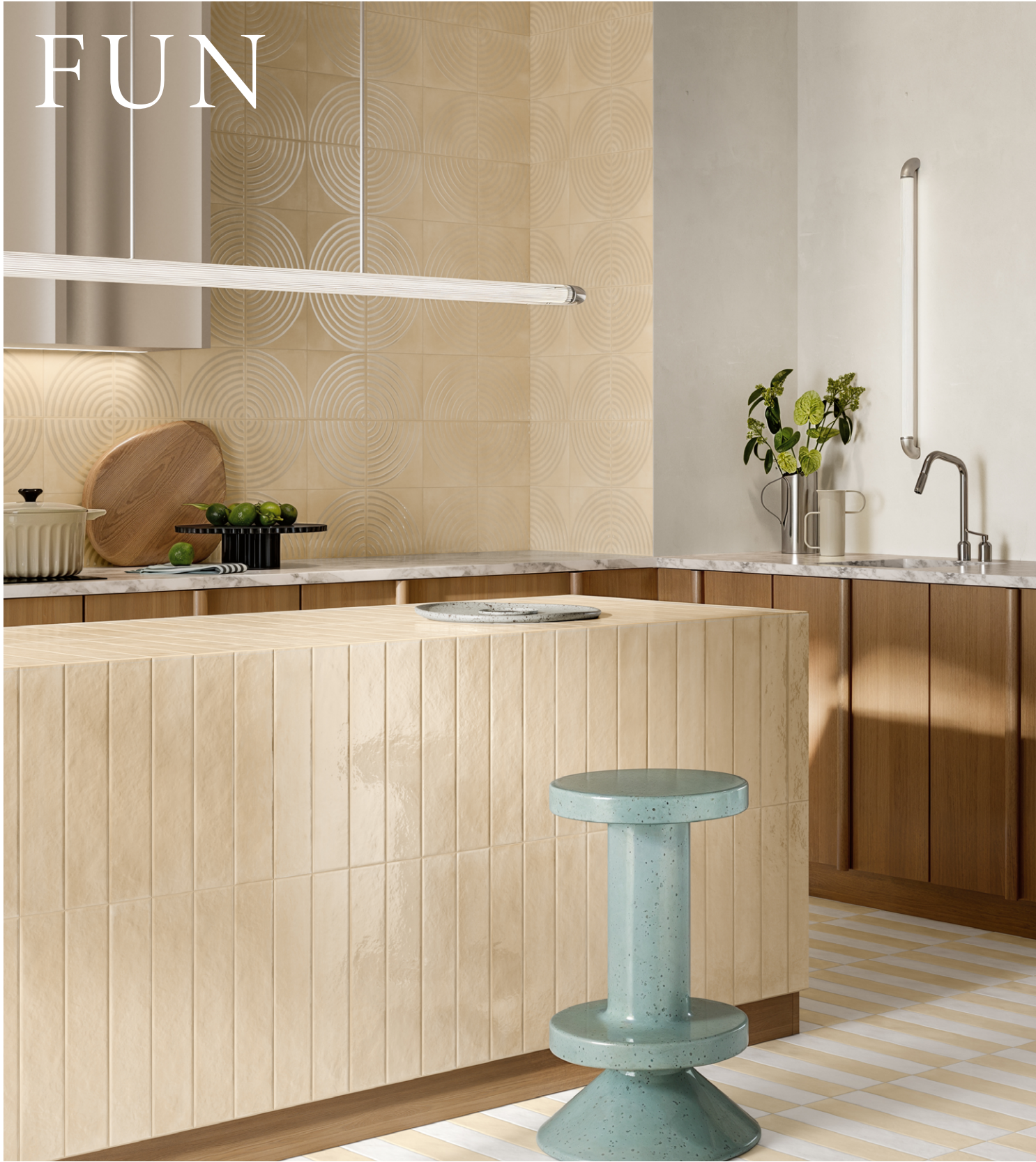
Special Order Aura in Puro and Desert

The formula for a whimsical interior is delightfully simple: start with warm wood tones and creamy off-white walls, add a charming pastel tile, and sprinkle in colorful resin accents wherever they shine best. Bonus points for a bold pattern—checkboard never fails—and a playful mix of glossy and matte finishes for tactile contrast. With light tones dominating the scene at Cersaie, it’s no surprise that pastels continue to steal the spotlight. While beige with a kiss of burgundy defines the season’s chic, sophisticated palette, her fun-loving sister brings a pastel base and crisp white accents.